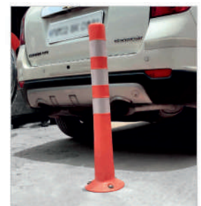
Back to Shape