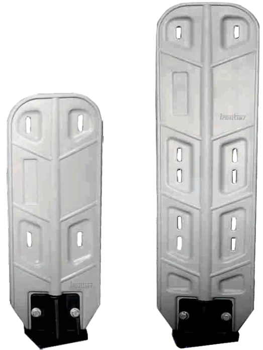
FAGS - 06