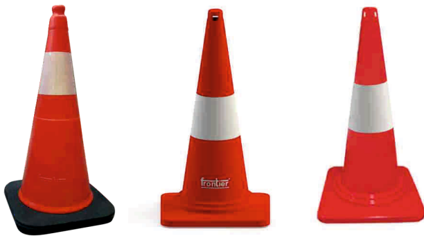
FTC - NHRB FTC - OP - SR FTC - OP - S