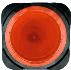
FTC - NHRB CONES