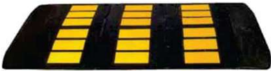
▲ Elegance Dimension: