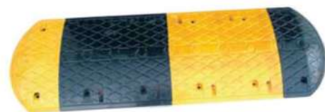
▲ Executive-1 Dimension:

Length : 250 mm Width : 380 mm Height : 50 mm Reflector : None Bolt Holes : 2 Holes