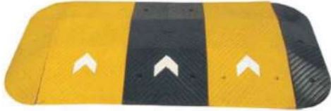
▲ Superior -1 Dimension: