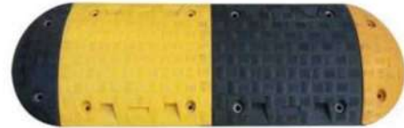
▲ Ridge - 3 Dimension:

Length : 250 mm Width : 1000 mm Height : 75 mm Reflector : None Bolt Holes : 3 Holes