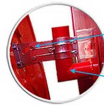
OUTDOOR WALL MOUNTING

Wall Mounting attachment Sold Separately